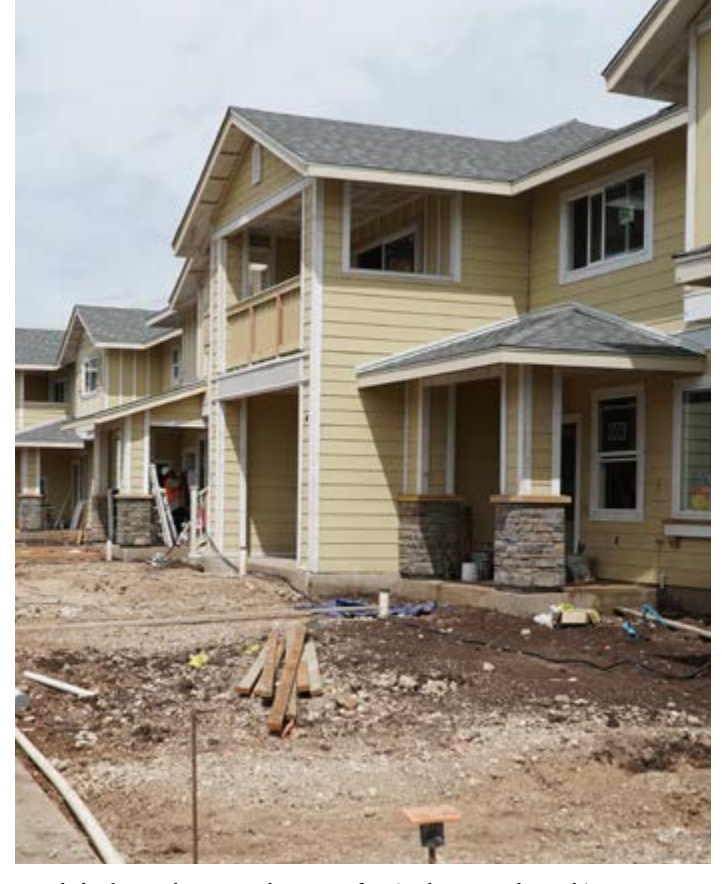
Newly built townhouses at phase one of Ho'opili in Kapolei and 'Ewa.

oʻopili, located on the West-side of Oahu will provide over 12,000 units, from townhouses to single-family lots in the Kapolei and 'Ewa area. The future community will also include retail, office, and industrial space, creating an urban, walkable, and mix-use neighborhood.