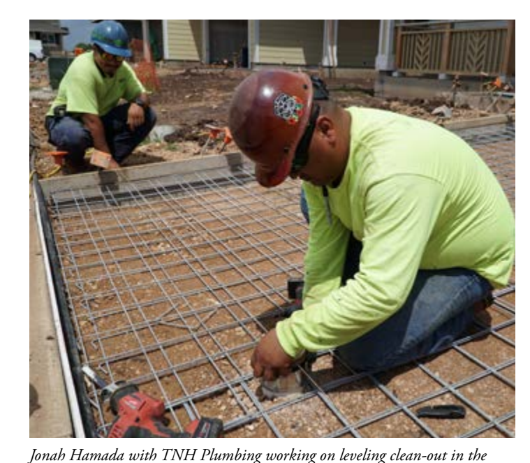
driveway of a single-family home.