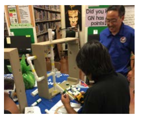
Attendees at the Moloka'i Career Fair learning about the construction trade industry through our hands-on PVC pipefitting project.