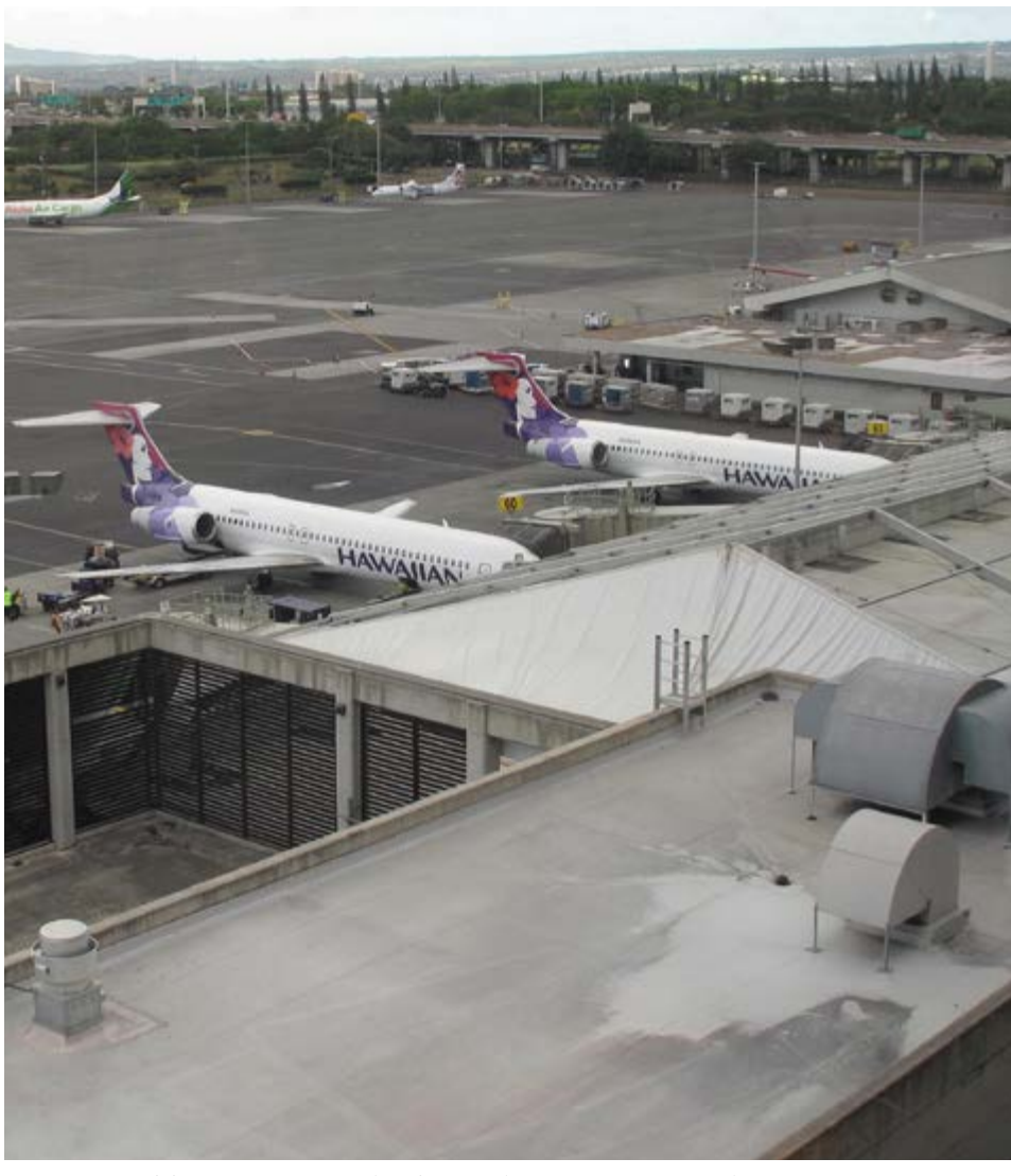
Current view of the commuter terminal at the Daniel K. Inouye International Airport.